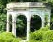
The Gazebo at Tibbetts Brook Park