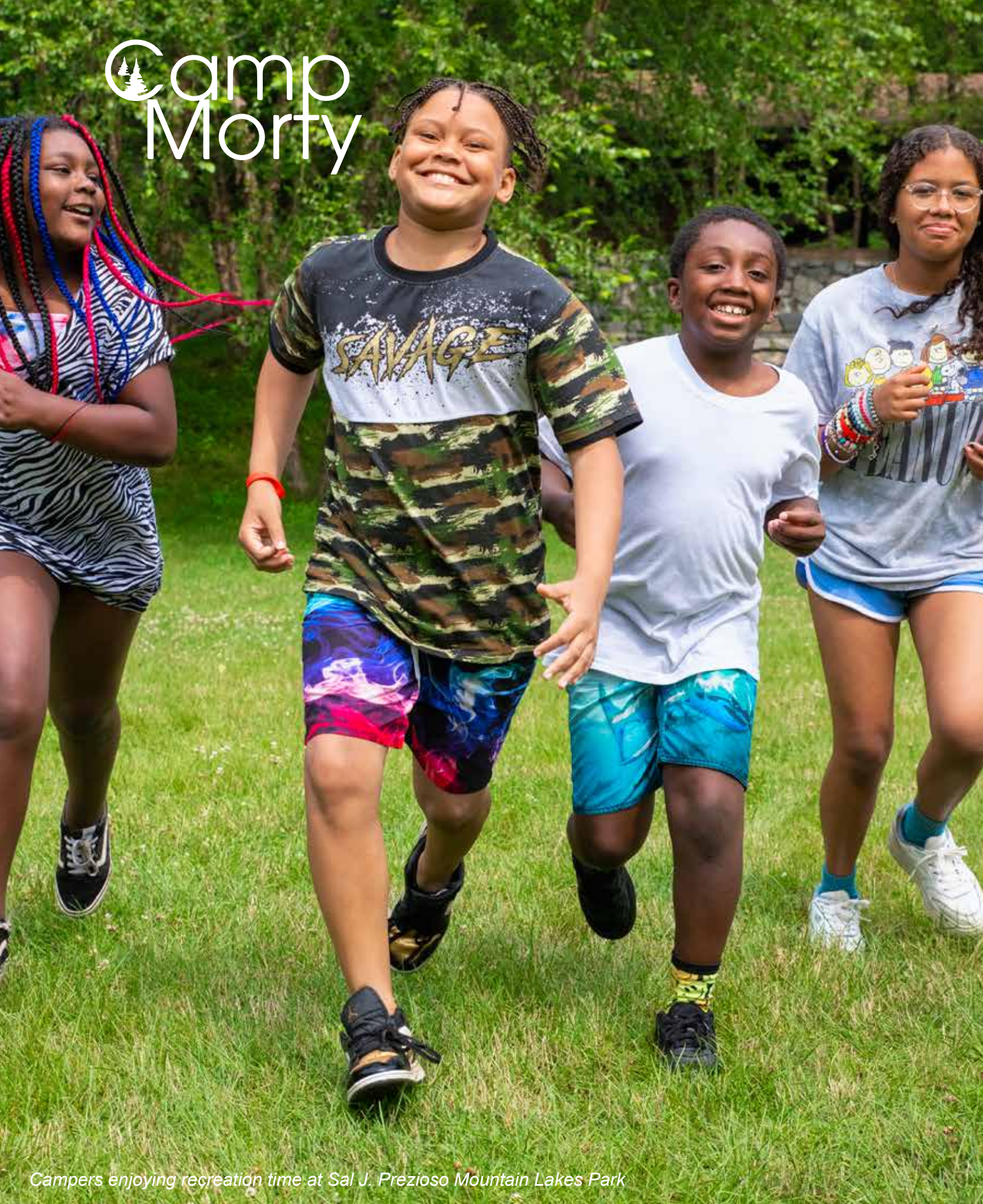
Campers enjoying recreation time at Sal J. Prezioso Mountain Lakes Park

In the summer of 2023, Camp Morty had another exciting season of overnight camp at Sal J. Prezioso Mountain Lakes Park! Westchester Parks Foundation staff dedicated months of planning over winter and spring to create dynamic programming for our campers. Camp Morty hosted staff from five countries including as far away as Australia. We were also proud to have had a total of 13 returning staff, including two former CITs. Our outstanding staff were ready to welcome our campers back to camp for an incredible summer!