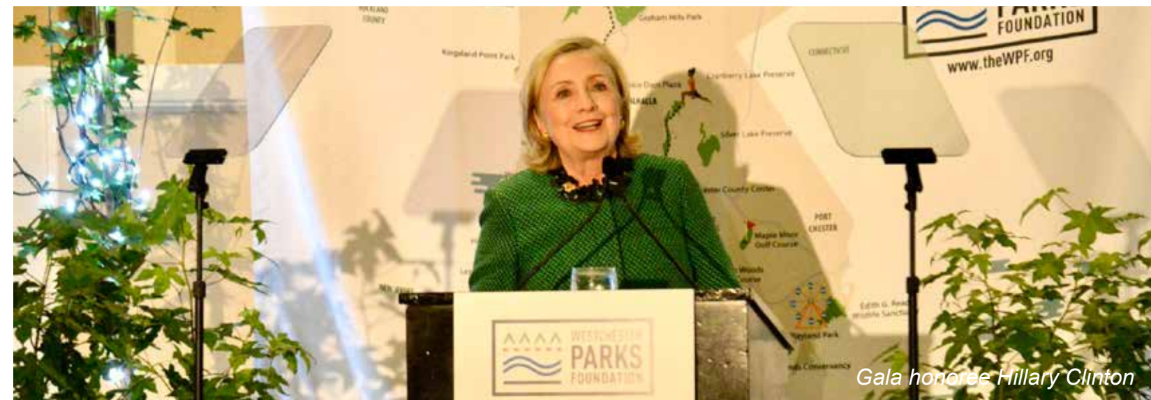
Gala honoree Hillary Clinton

On the beautiful night of September 21, Westchester Parks Foundation and our dedicated supporters filled the large upstairs ballroom at Glen Island Harbour Club. Not only did we celebrate a successful evening of fundraising, but our generous attendees raised their paddles high in support of our new adaptive hiking program, Trails Without Limits! We are sincerely grateful and look forward to continuing to honor Westchester County's park and open space champions!