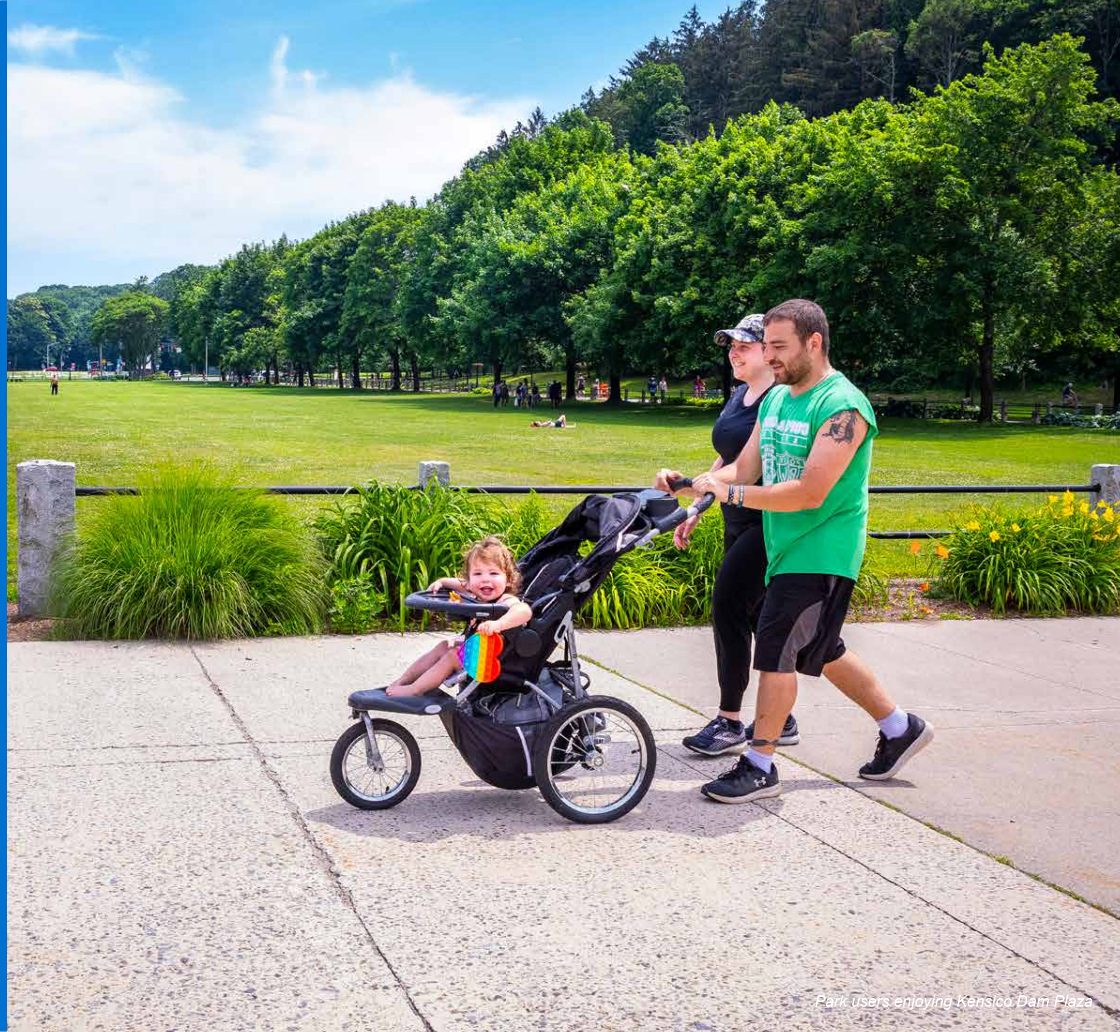
Park users enjoying Kensico Dam Plaza

We are united by the fact that we all have fond memories and experiences in our parks and outdoor spaces. Everyone, from all walks of life, refresh mind and body in our parks. Westchester County Parks are home to a wide array of settings including lakes, bike trails, golf courses, beaches, pools, campgrounds, athletic fields and nature preserves. We are lucky to say that few other areas in the country have such a large and varied parks system – open to all and available for everyone to enjoy. Whatever you like to do, there is a park in Westchester for you, so let's collectively support and preserve them for future generations.