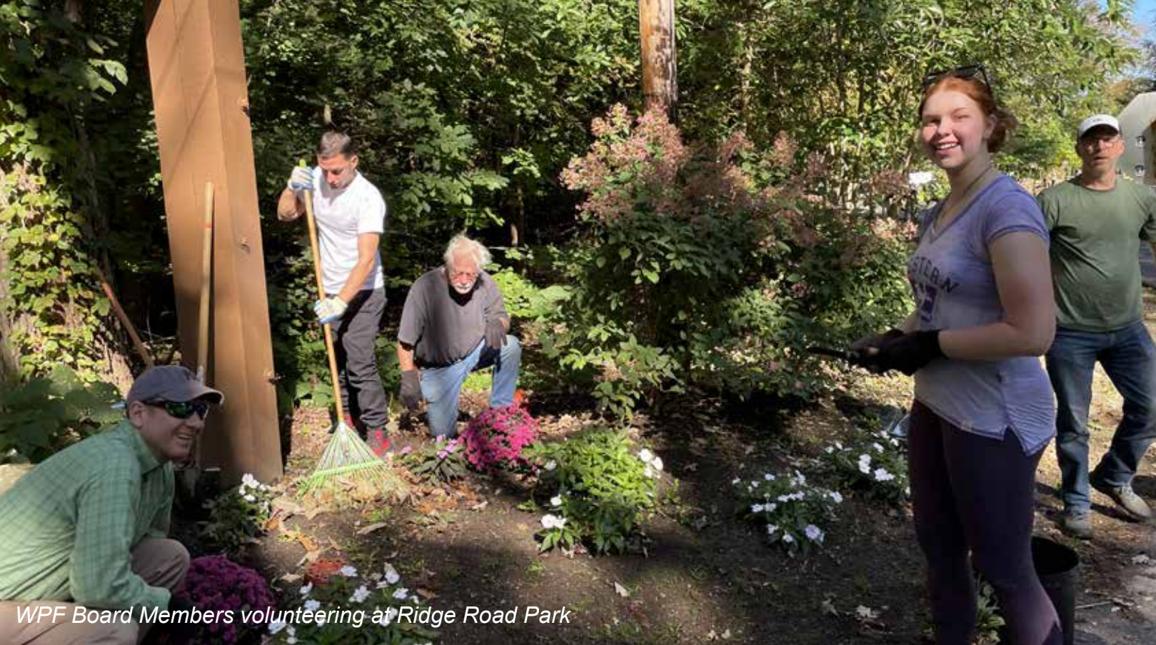
WPF Board Members volunteering at Ridge Road Park