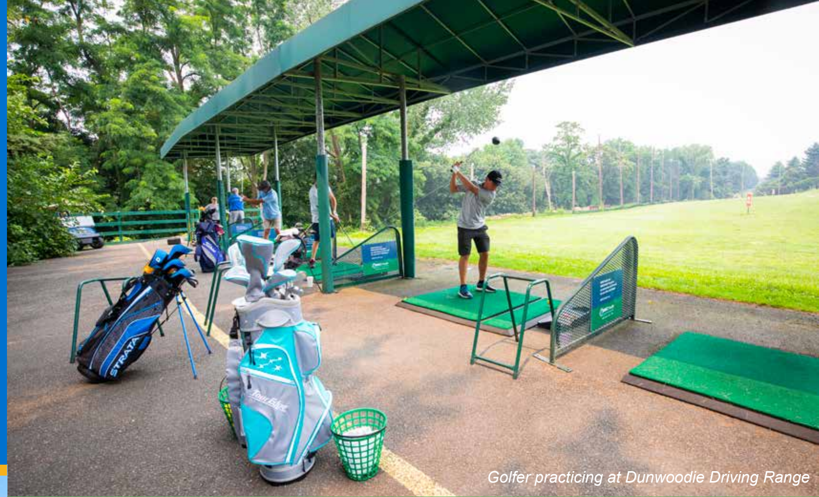
Golfer practicing at Dunwoodie Driving Range

Bicycle Sunday participants stopped by the Northbound rest stop to meet WPF Staff, learn about our various programs throughout the year, receive giveaways, and enjoy refreshments. Our Westchester community continues to show their love for this iconic Westchester tradition. The public has contributed to fundraising, voiced support through social media, and shown strong attendance on event Sundays totaling an incredible 13 days this season. Bicycle Sundays continues to provide opportunities during a time when people need outlets for recreation and fitness. We love that people got out of their cars each week to make incredible memories on the Parkway. Incredibly, over 60,000 people biked, walked, and jogged in the 2023 season.