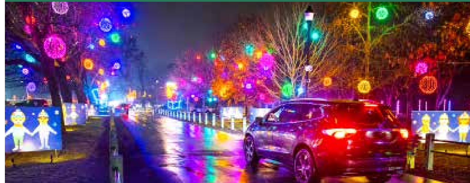
Attractions at this year's Westchester's Winter Wonderland 14

Winter Wonderland attendees also generously supported the Maria Fareri Children's Hospital and Camp Morty in the Help to Heal initiative . The light show was created and programmed this year by the incredibly creative minds of Eclectic Precision and Dark Tech Effects. We are sincerely grateful to our founding presenting sponsor Westchester Medical Center Health Network and returning platinum sponsor Con Edison. We also thank tree lighting sponsor Robison Oil, New Year's Eve sponsor M&T Bank, Holiday music sponsor Iona Preparatory School, live character sponsor Wegmans, and as always, our media sponsors Westchester County Tourism, Westchester Magazine, and Altice Media. The use and enjoyment of our parks is core to our mission, and Winter Wonderland invites people of all ages to enjoy the spectacular beauty of Kensico Dam Plaza during the holiday season. Proceeds from this event directly benefit Westchester Parks Foundation and allow us to serve the park system year-round through programming, advocacy, and direct support.