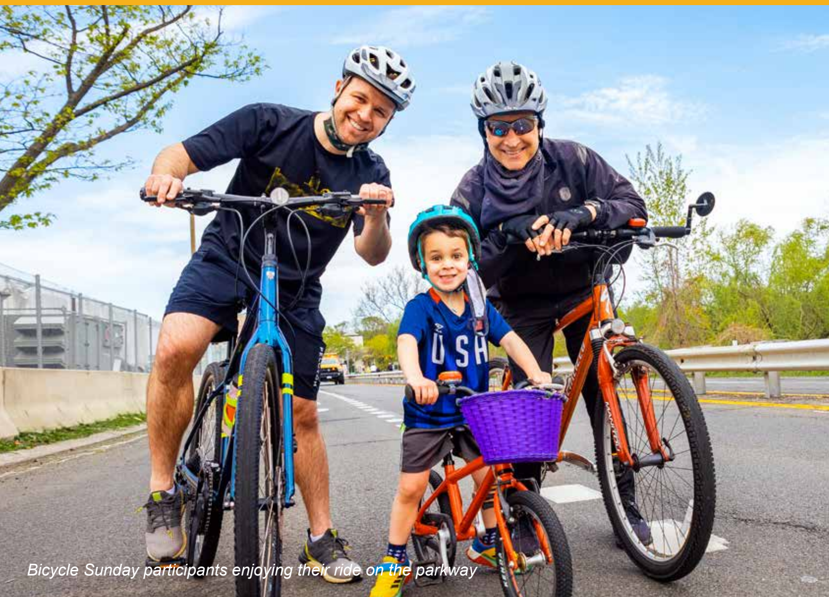
Bicycle Sunday participants enjoying their ride on the parkway