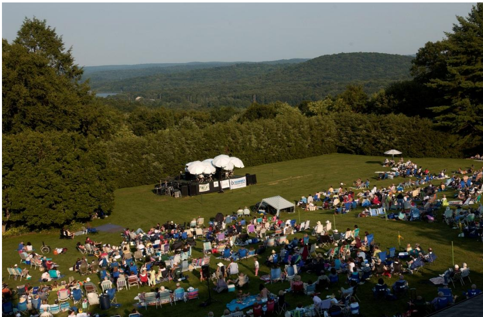
Figure 11 illustrates the total final economic impact of Lasdon Concert. Column 1 shows the output in terms of dollars. Columns 2 and 3 are estimates of the final effect earnings and employment (jobs), on the Westchester County area. The Final-demand Value-added in dollars is shown in Column 4. The Final-demand Value-added factors include direct, indirect, and induced economic impacts. This economic benefit is estimated to be $43,481.